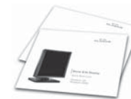
Dome E3n and Dome CXtra quick references